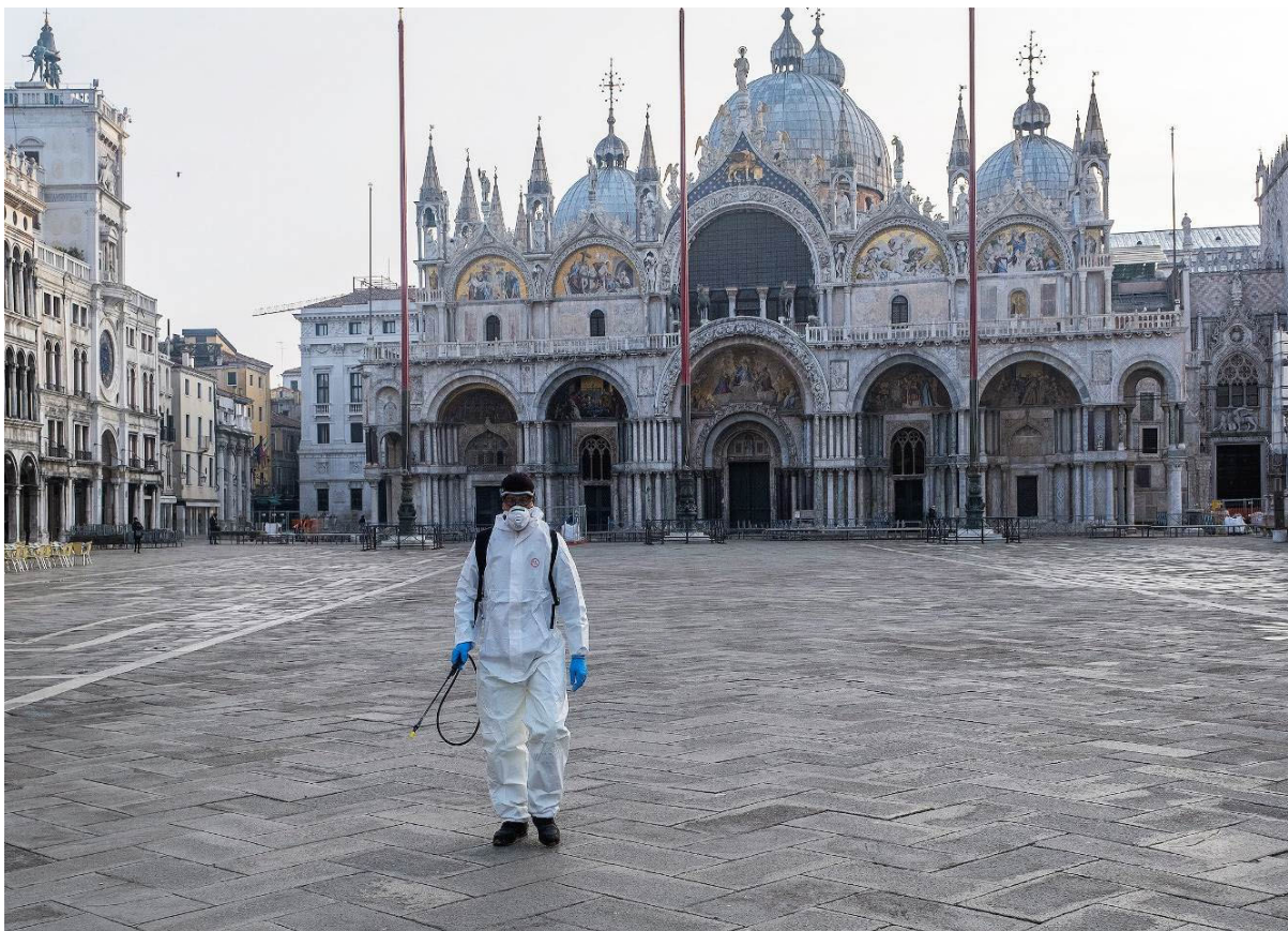
Saint Marco Square, Venice